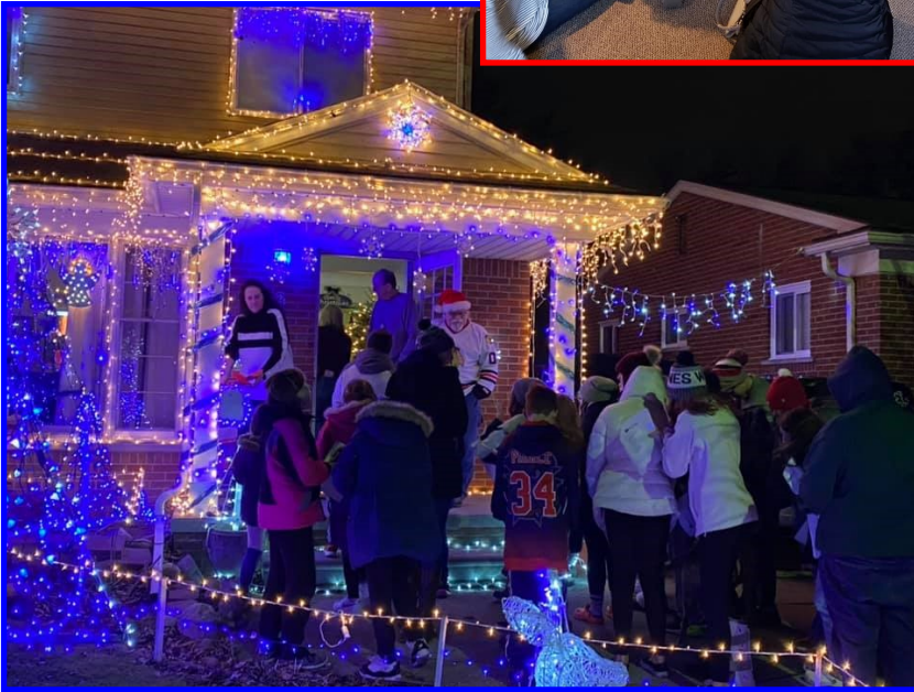
Youth Groups out caroling