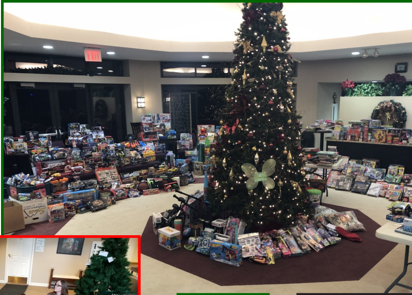
Cops For Kids