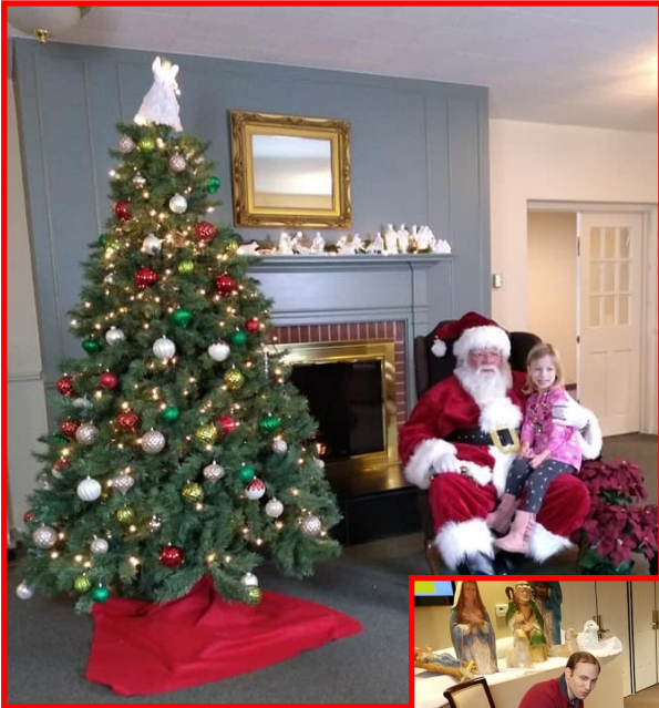
Selfies With Santa