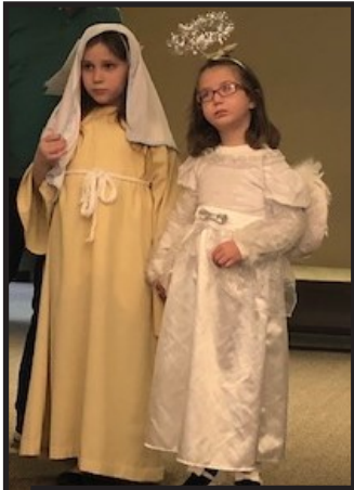
Choir Concert Pageant