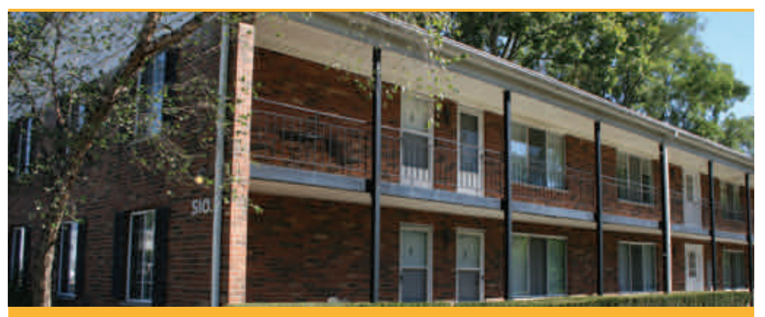
ROCHESTER ROAD APARTMENTS 510 N. Rochester Rd. | Clawson, MI 48017