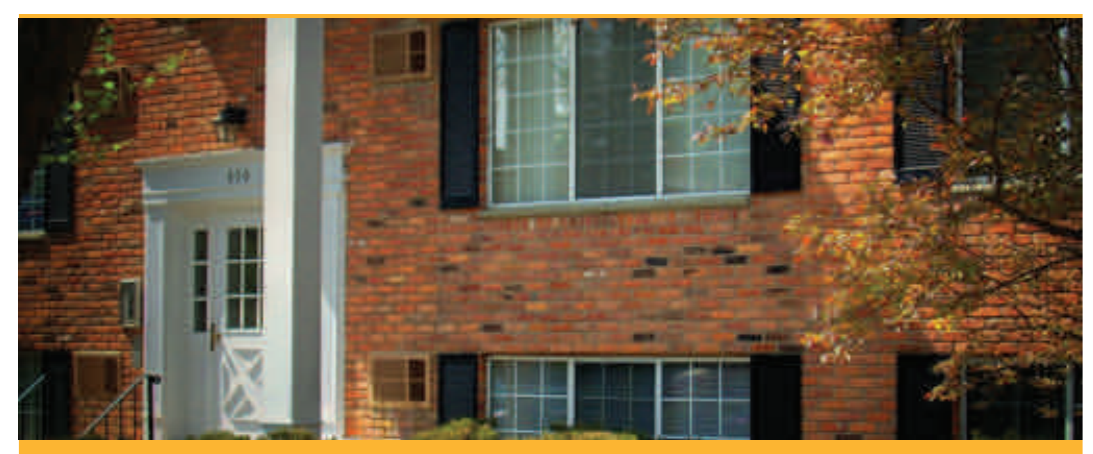
HARTFORD PLACE APARTMENTS 650, 670, 672 Ann Street | Birmingham, MI 48009