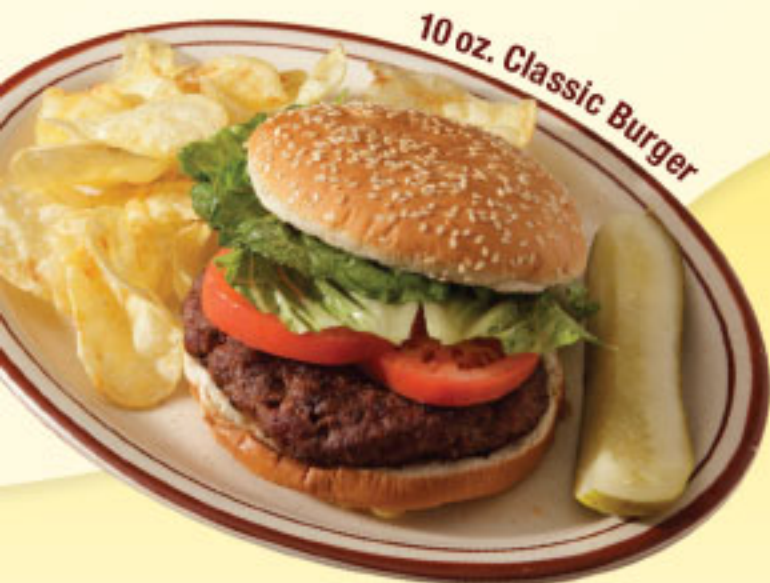
10 oz. Classic Burger