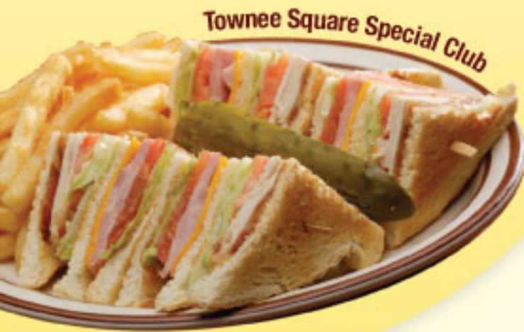
Townee Square Special Club