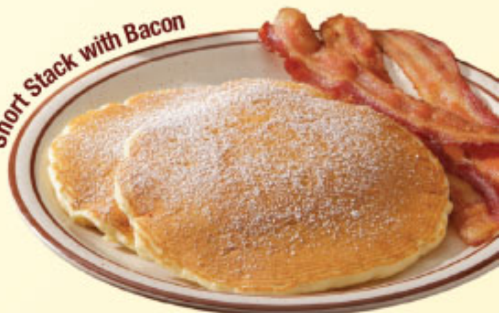
Short Stack with Bacon

Served with sour cream or apple sauce. 5.79