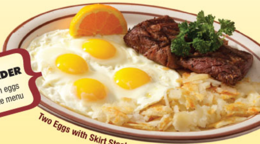
Two Eggs with Skirt Steak

You get 2 country fresh eggs for each ordered from the menu