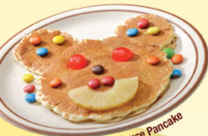
Rainbow Mickey Mouse Pancake