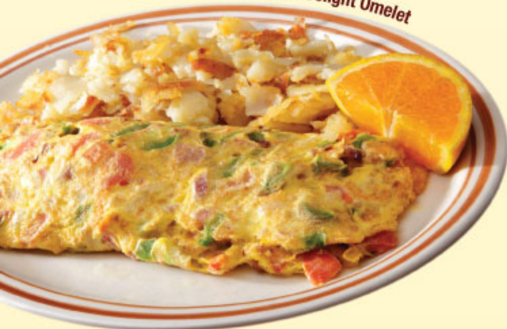
Garden Delight Omelet

Oven-roasted apple with cinnamon and melted cheddar. 7.59