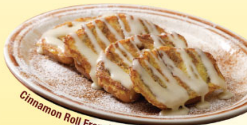
Cinnamon Roll French Toast